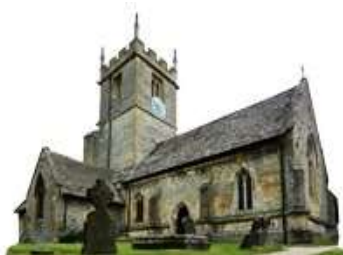
Hampton – Fairfield – Thistledown Eastwick Park – Charity Crescent