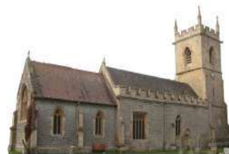
Hinton on the Green